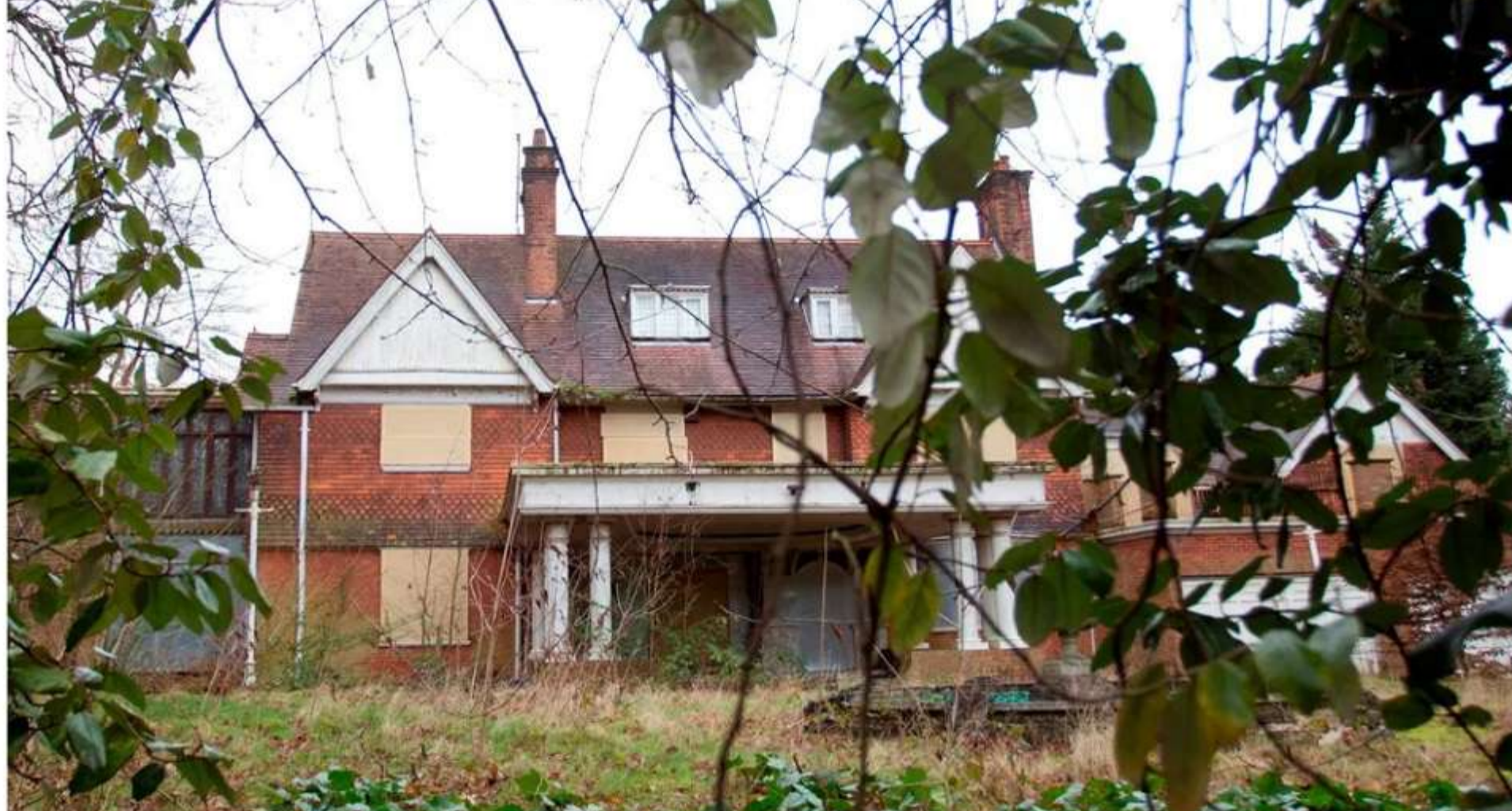
This 10-bedroom house had already been empty 10 years when this photo was taken in 2016

"One gentleman from Russia never leaves The Bishops Avenue. He won't even go around the corner," a local estate agent told Business Insider.