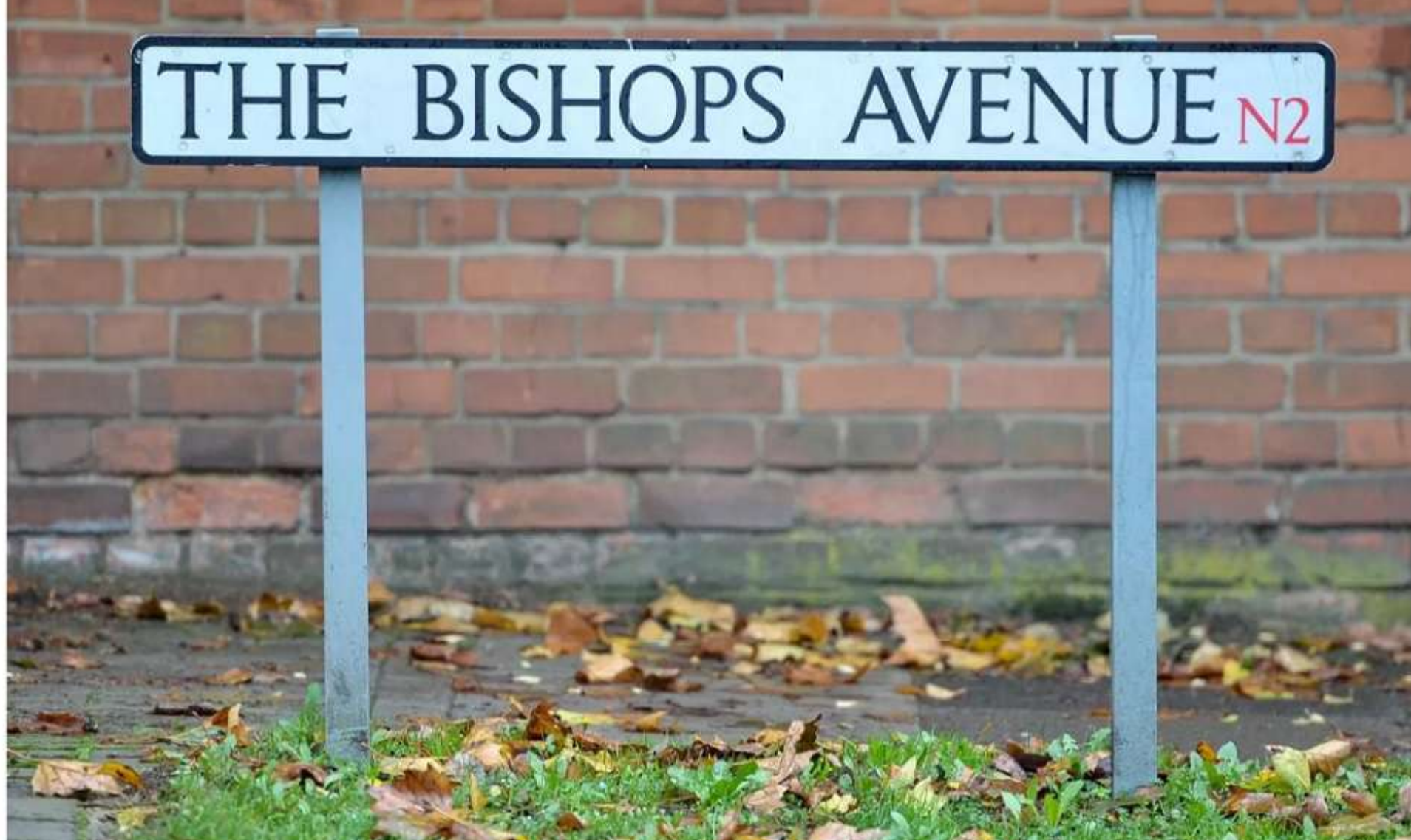
The Bishops Avenue is known as Billionaires' Row

The street's history is both intriguing and enigmatic. By the 1930s, it had already earned the nickname "Millionaire's Row", with a few mansions already established.