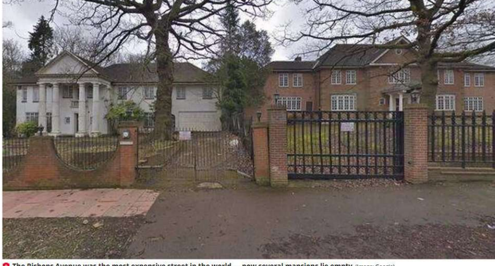
The Bishops Avenue was the most expensive street in the world — now several mansions lie empty

Heath Hall, a prestigious home owned by a Czech magnate, housed celebrities such as Justin Bieber and Salma Hayek, is another of the prestigious estates.