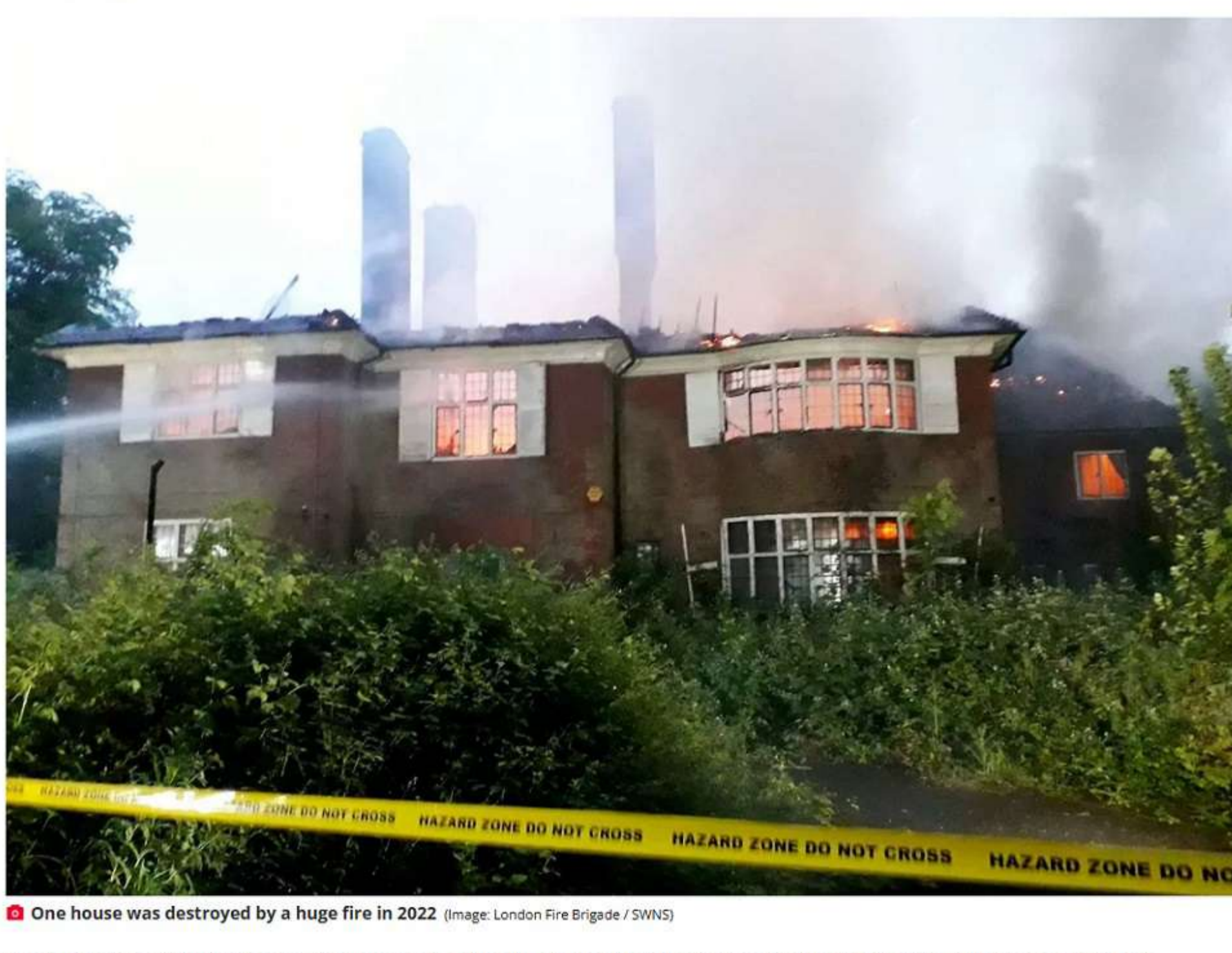
One house was destroyed by a huge fire in 2022

One of the properties was once home to a Nigerian politician. After his death in 2007, it was taken over by squatters and subsequently burned down.