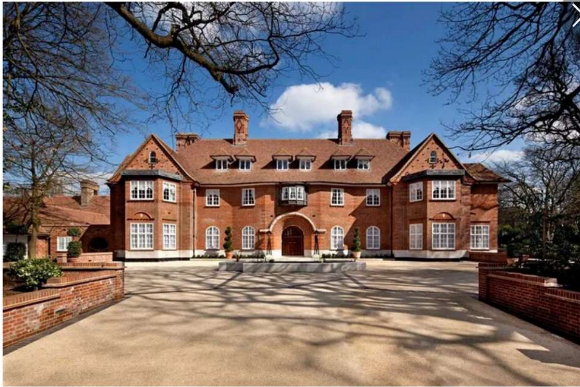
The magnificent Heath Hall

By Ketsuda Phoutinane Deputy Trends Editor & Steffan Rhys 14:50, 9 OCT 2024