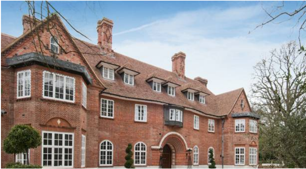
Moving on: Andreas Panayiotou's lavish home on The Bishops Avenue, which is on the market for £100 million