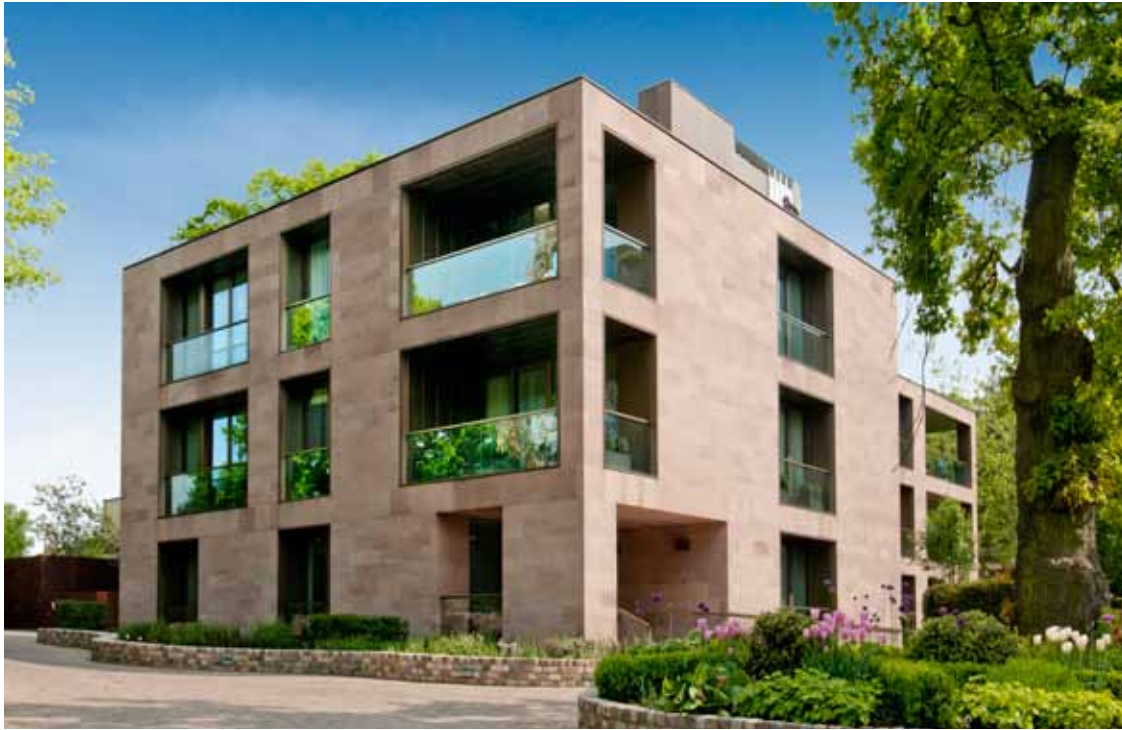
CAENWOOD COURT APARTMENT | KENWOOD N6