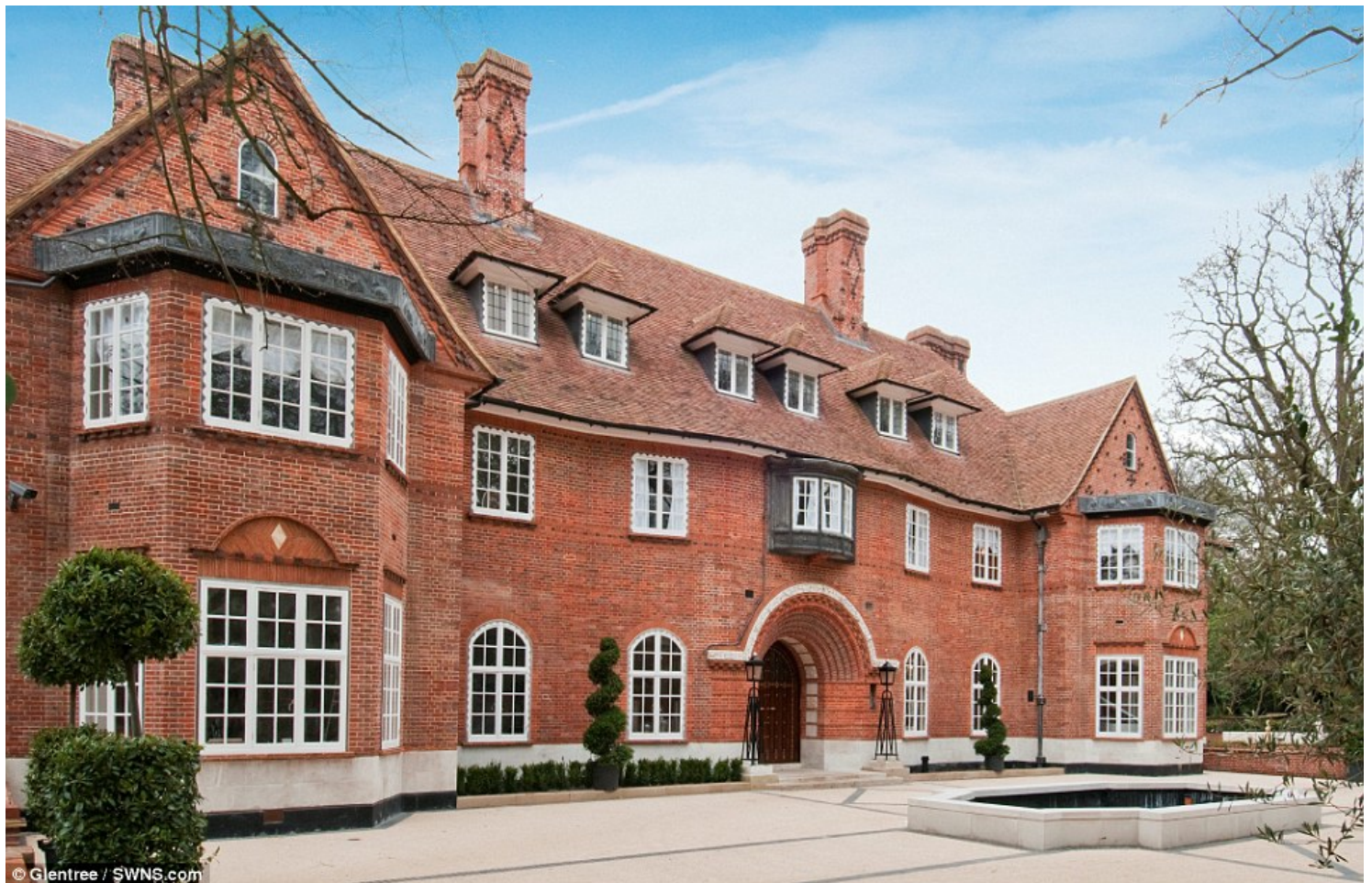
How much? This stunning mansion on a Hampstead street known as billionaires' row has gone on sale for £100million, making it the most expensive home on the market

It fell into disrepair until property magnate Andreas Panayiotou bought it in 2006 and transformed it into one of the capital's finest properties.