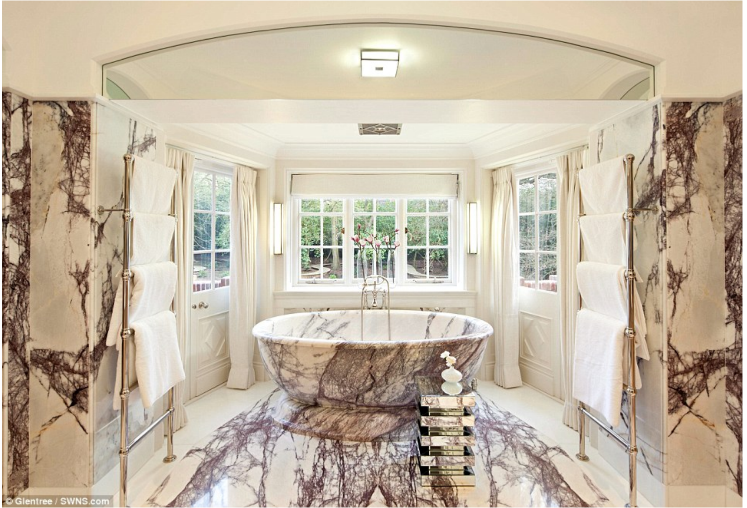
High-class finish: Twelve types of Italian marble and seven types of wood, all prepared in Italy, were used for the bathrooms, according to the estate agents

Music to the owner's ears: Mr Panayiotou employed a team of 120 tradesmen for the renovation, adding a further 8,000sq/ft to the already substantial 19,000sq/ft