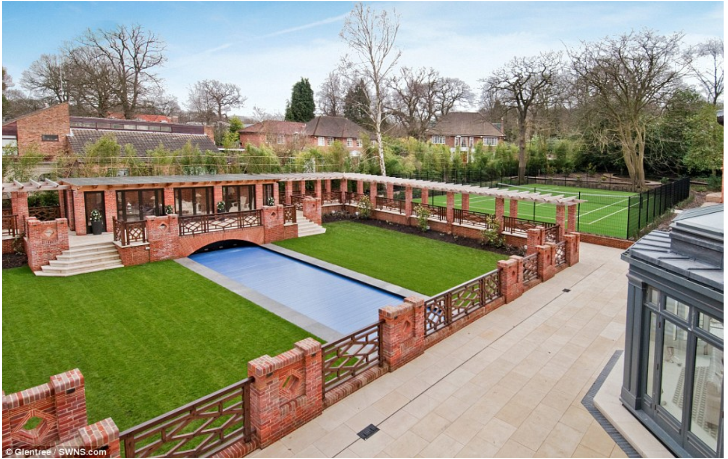
Tranquil: The home, set in 2.5 acres of manicured gardens, is one of the largest private properties in the capital, but comes with a stamp duty fee of £7million

He was ranked 200th in last year's UK Rich List after building up a £400million property empire, a remarkable achievement given that he suffers from dyslexia.